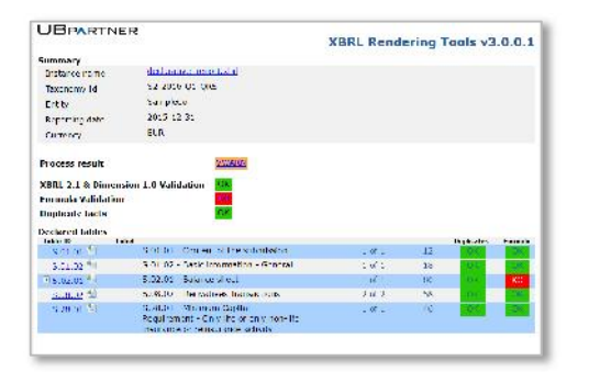
Summary Report to quickly identify errors

Each of the tools provides a range of reports to help users successfully manage the reporting process: